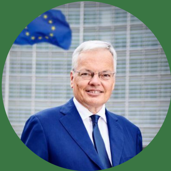
Didier Reynders (DG JUST)