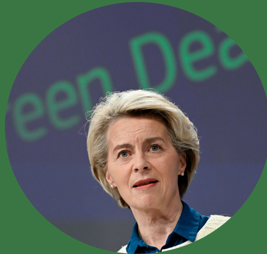
EC President Ms Ursula Von Der Leyen