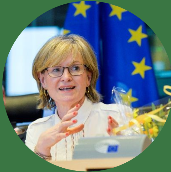
Mairead McGuinness (DG FISMA)